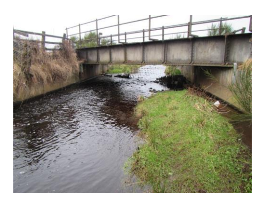
Railway bridge in 2020 with bar now covered with fine sediments, vegetated and stable.