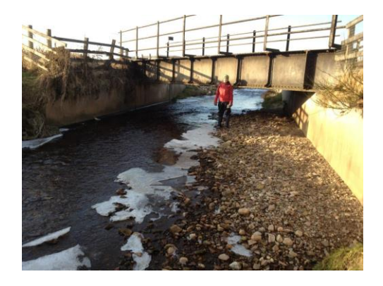
Railway bridge in 2012 with active gravel bar

The Deveron, Bogie & Isla Rivers Charitable Trust received the award so that an audit of Crooksmill Burn (in various locations points of the burn) could be carried out to see the changes from when the audit was last done in 2012. See the below pictures for just one example of how it is changed over time.