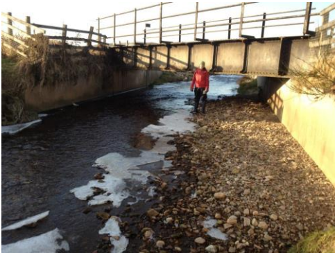
Railway bridge in 2012 with active gravel bar

The Deveron, Bogie & Isla Rivers Charitable Trust received the award so that an audit of Crooksmill Burn (in various locations points of the burn) could be carried out to see the changes from when the audit was last done in 2012. See the below pictures for just one example of how it is changed over time.