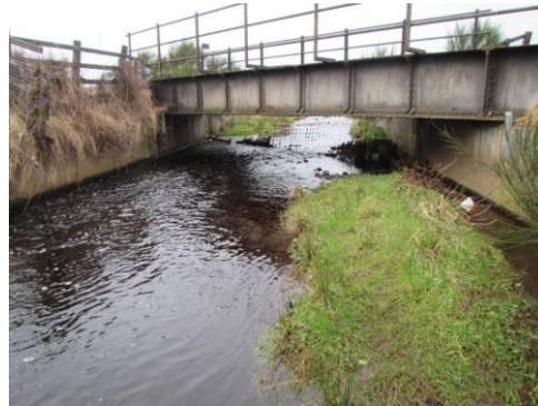
Railway bridge in 2020 with bar now covered with fine sediments, vegetated and stable.